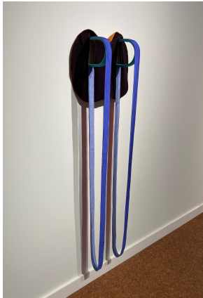
Conveyor , 2020 Silk, polyester, and aluminum 54" x 16" x 7"