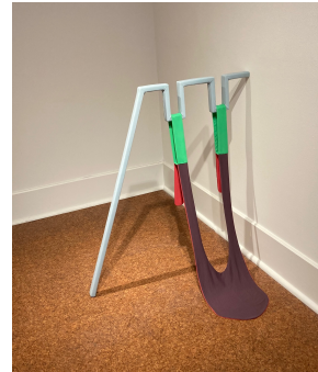
Lobe , 2019 Polyester and wood 44" x 22" x 38"