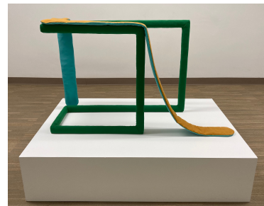
Workaround , 2014 Polyester and wood 28" x 48" x 18"